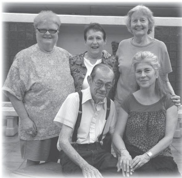
Through good times and tough times – caregivers from our Alzheimer’s support group help one another throughout their journeys.

Caregiver support groups become families. Many members have participated 5 years or more. We laugh, cry, and share concerns. When loved ones pass away, caregivers often continue in the group. It helps with grieving and allows those who “walked the walk” to help those beginning the journey.